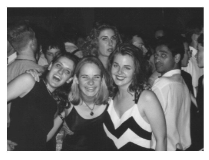
A small but cosy group celebrate after their Graduation Ceremony

The class of 1999 would like to thank our two supporters of the graduation dinner the Medical Society Bookshop and MedFin.